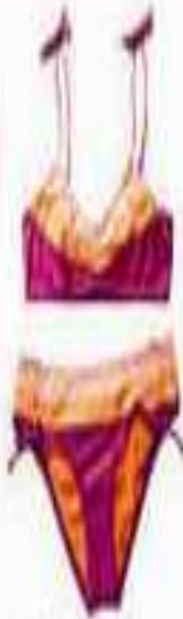
2 piece Bathing Suit