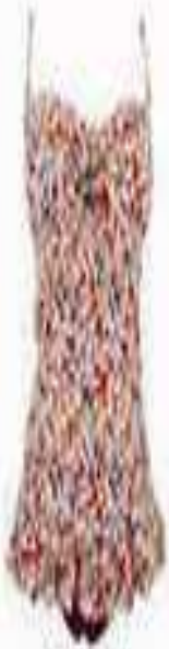
2 piece Tankini