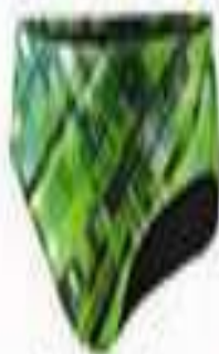
Short Swim Briefs