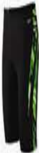
Long Swim Briefs